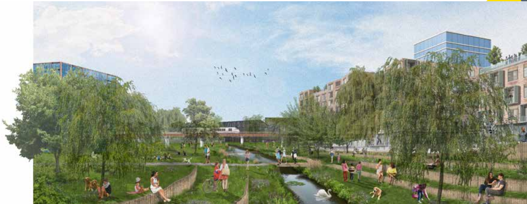
The Parklands community quarter

This approach will also create a future proofed environment that can respond to climate change and other priorities. Following the launch of this masterplan, Arden Cross will consult widely to build consensus and work corroboratively to ensure the development is maximised to the benefit of everyone, both inside and outside the site.