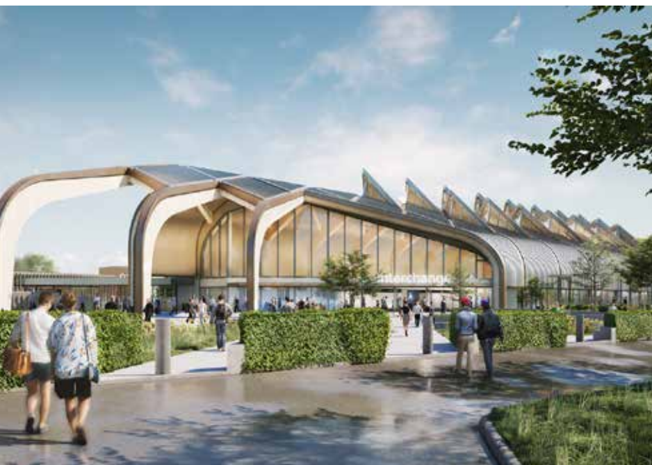
HS2 Interchange Station