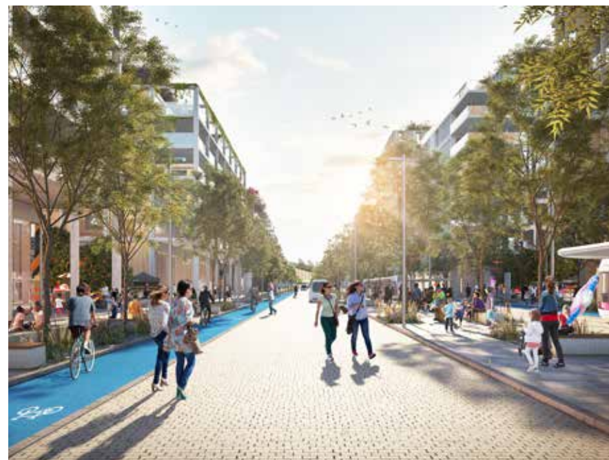
The Central Avenue multi-modal corridor

Arden Cross will create a whole new commercial and residential community of national importance, centred around the principles of sustainability and connectivity.