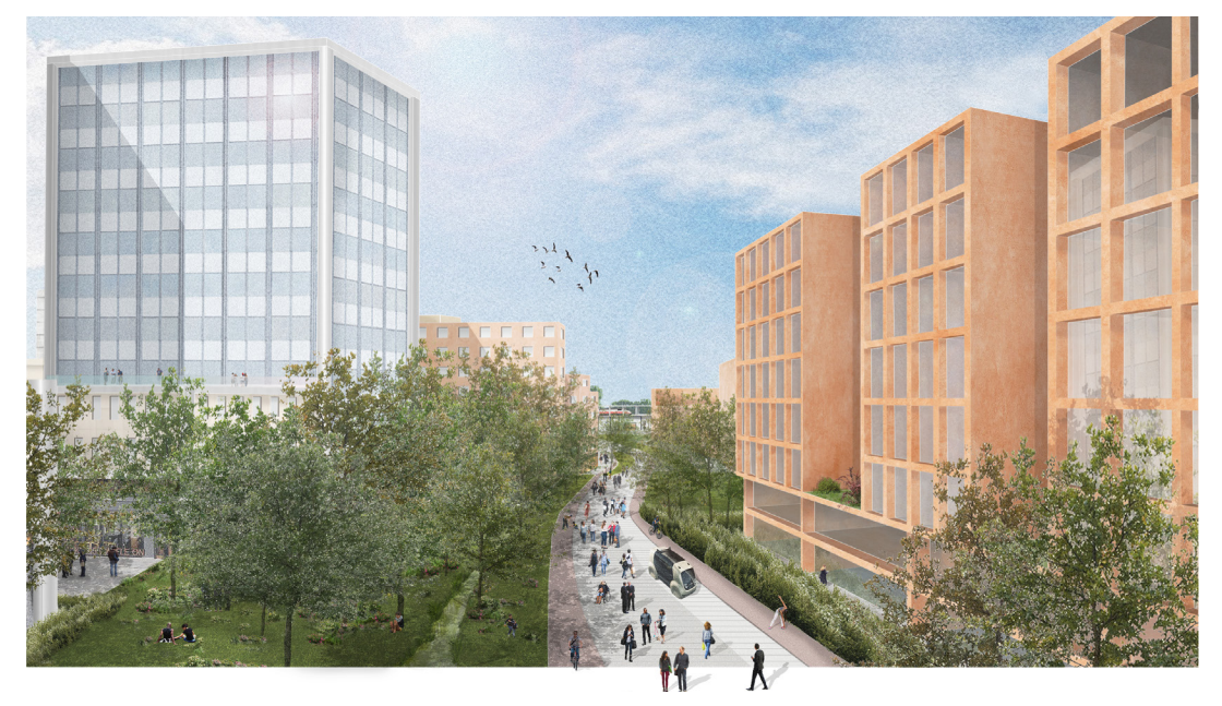
Middle Bickenhill repurposed as a dedicated pedestrian/cycle and mass transit corridor

Energy efficiency and affordability will be maximised in all new housing that will be built in Arden Cross. This will deliver better health for residents and visitors to the area and create a sustainable place to live, work and socialise.